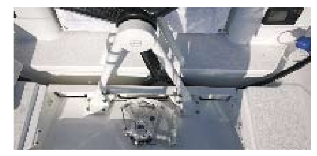
Friction free direct cable steering has a "first class feel ".