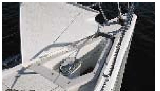
The recessed anchor box with electrical anchor windlass for cruising.