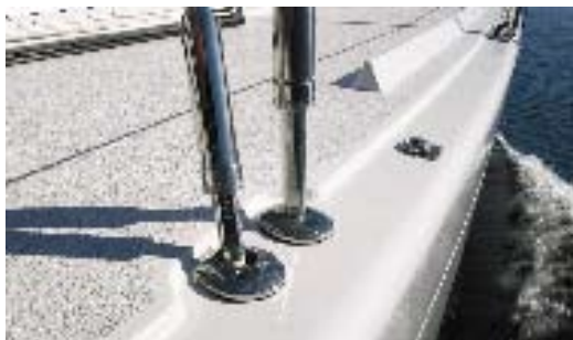
Outboard tip cups include a scale for the rough trim guide.