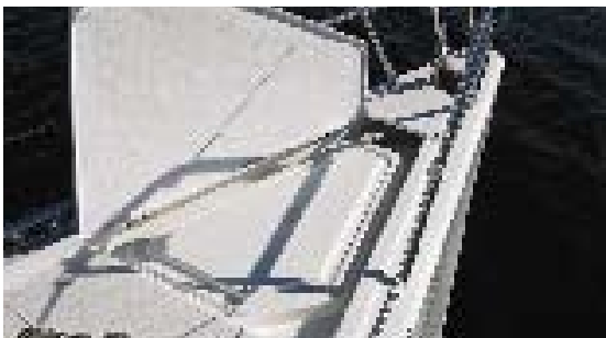
The anchor box, including winch, is easily and quickly removed for racing.