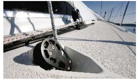
X-Yachts' mainsheet system and genoa car adjustment led back to the cockpit.