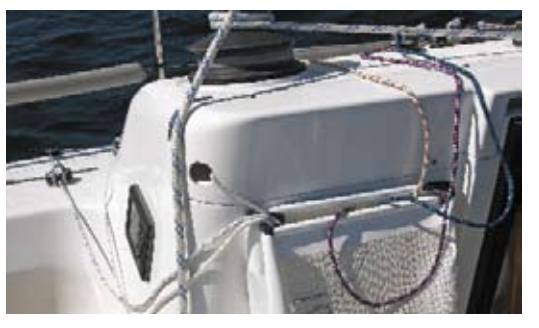
Genoa inhauler line adjusted from the cockpit.